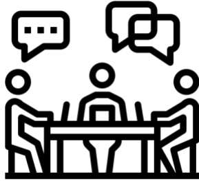
Markit! Meeting notes