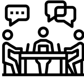
Markit! Meeting notes