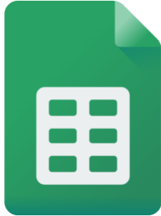
Markup Sheet (GSheet)